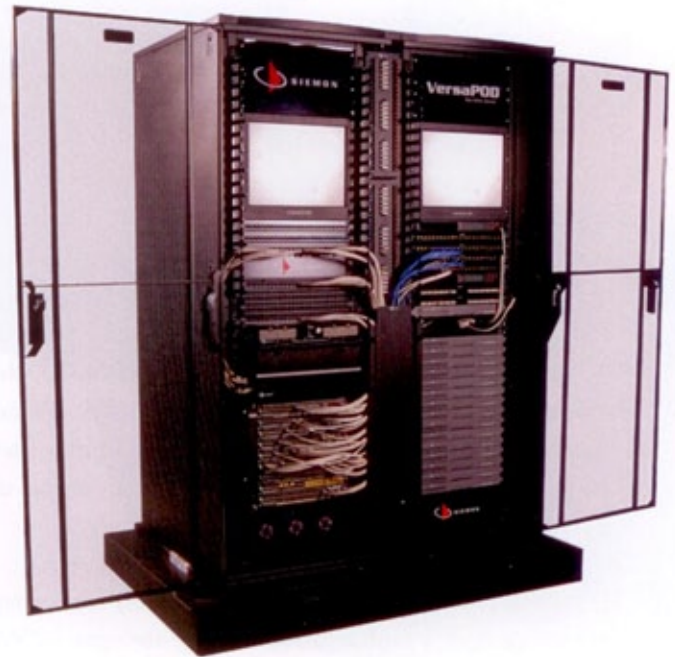
Figure 2: Siemon's VersaPOD

The VersaPOD solution integrates bayed Data Center cabinets with high density zero-U vertical patching and cable management. The VersaPOD's unique design leverages the vertical space between bayed cabinets for patching or cable management, freeing critical horizontal cabinet space for active equipment and improving overall density. In the Moorings Park data center, this vertical space is leveraged as an efficient cable management system. In the horizontal cabinet space, angled Siemon TERA-MAX patch panels allow patch